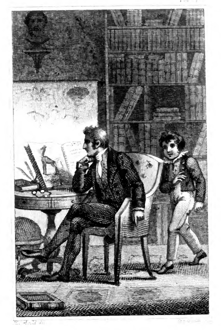
THE KIND TUTOR